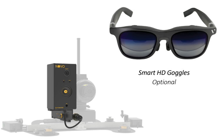
Laser Pointer Optional for the 3D Arc